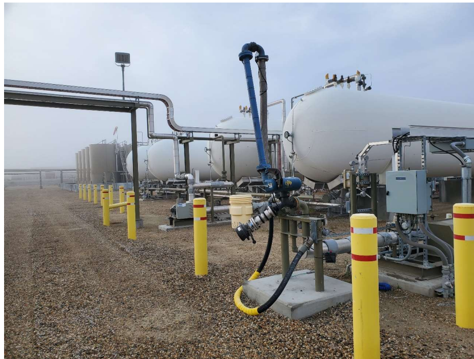
NGL LOADING FACILITY, HIGHWAY 30 ANNUAL PLANT INSPECTION PAYETTE CO. ID NOVEMBER 2021

2022 1st Quarter Report will be provided during 2nd Quarter 2022