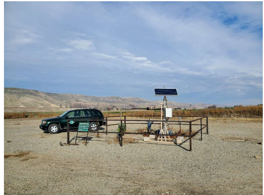
ANNUAL WELL SITE INSPECTION ML INVESTMENTS #3-10 WILLOW FIELD, PAYETTE CO, ID